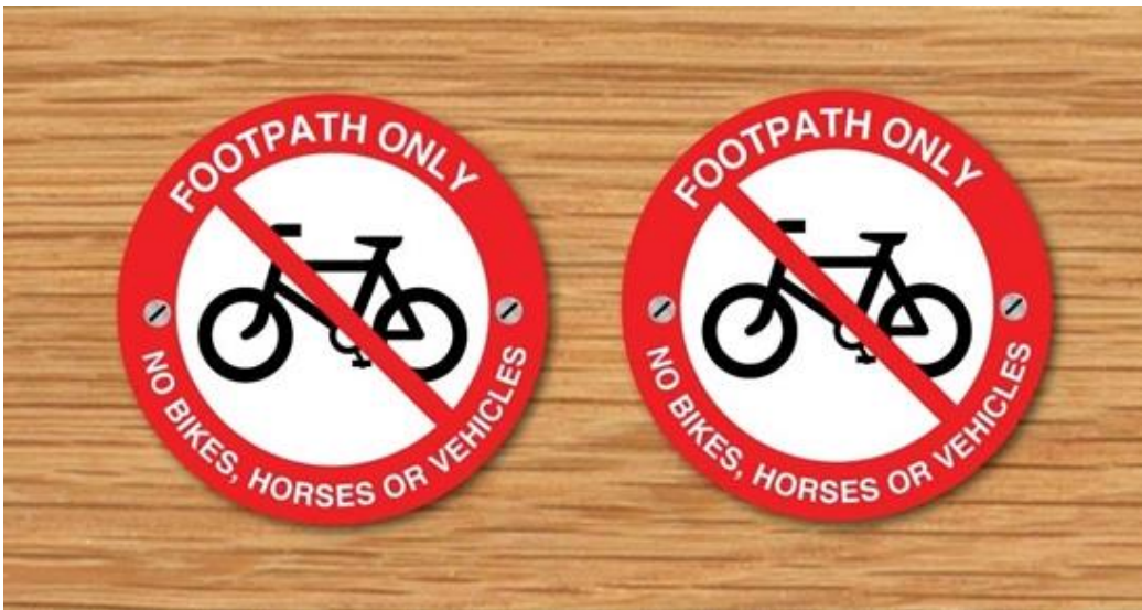
JAF Graphics. No Bikes Footpath Only Signs - Pack of 2 From £12 for a pack of 2