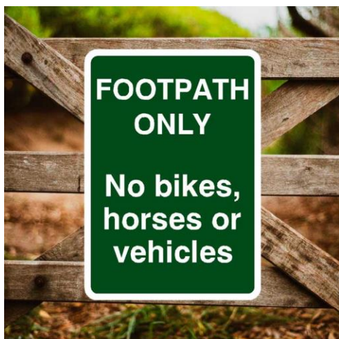
Footpath Only No Bikes, Horses Or Vehicles Sign Portrait