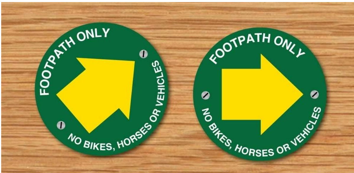
JAF Graphics. Footpath Arrow No Bikes No Horses